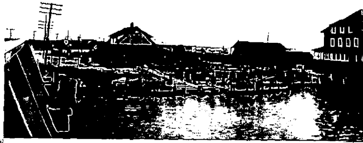
Photograph taken from the west end of Manahawkin-Beach Arlington Highway Bridge- shows small piers on the northerly side of the bridge. Photo taken toward the west.