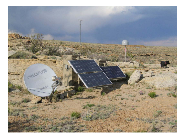
Fig. 2. CORS site P028, located in Chaco Canyon, NM, and established/owned by the Plate Boundary Observatory. Pictured are: satellite dish for data communications, solar panels, equipment housing boxes, and GPS antenna attached to anchored mount.

CORS observation data files consist of GPS code and carrier phase observations, which are provided in the universally recognized Receiver Independent Exchange (RINEX) format. Users retrieving data via the World Wide Web interface have two different options for requesting data –