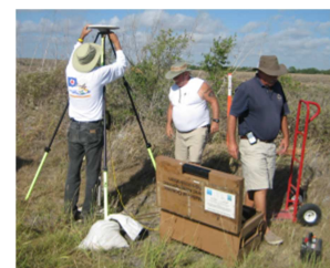
Figure 3. Deflection of the Vertical camera and GPS collected for geoid slopevalidation survey