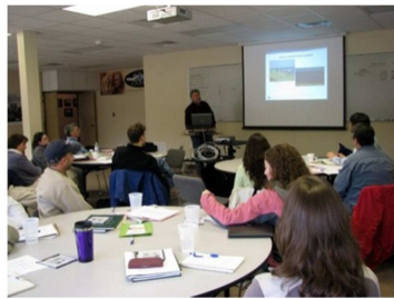
Figure 4. NGS Training Center, Corbin, Virginia

Communication and education have long been an important part of NGS' service to its user community. Through the Height Modernization Program, NGS will keep the surveying community and other users informed of decisions and status of various programs and projects, through publication of technical papers and reports in scientific journals, professional publications, and outreach materials. A section of the NGS web site dedicated to the Height Modernization Program has recently been updated to provide more comprehensive and timely information. The site includes links to key programs like GRAV-D, the Geoid model pages, the NGS Tool Kit, and research projects.