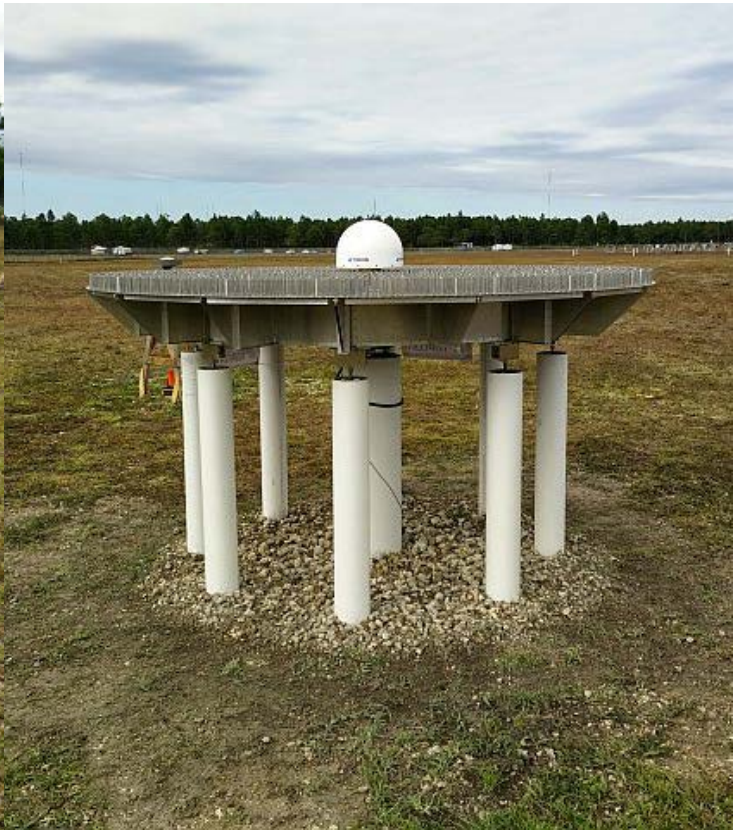
Figure 11 – FLF2 , large format GNSS antenna, a.k.a. BigAnt.