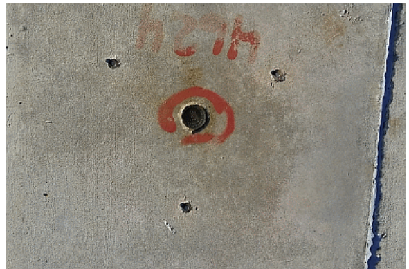
Figure 4 - 7295 (RCM2)

RCM2 is a NGS horizontal control mark disk stamped ---7295 1988--- and cemented into a drill hole in the center of a concrete pad.