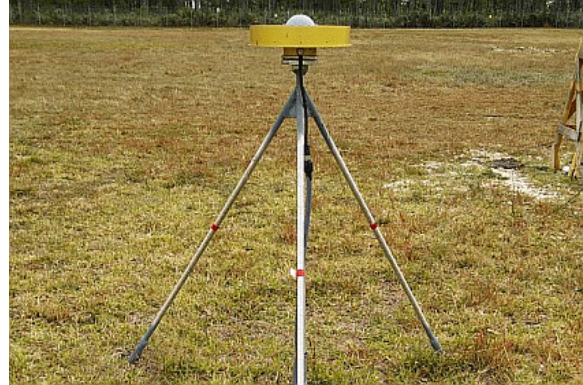
Figure 7 - FL FOUNDATION 1 (FLF1)

TIMER is a USC&GS triangulation station disk stamped ---TIMER 1962---, recessed 5 cm below the ground and in the top of a square concrete post extending to a depth of 90 cm.