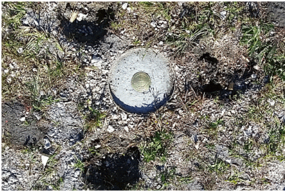
Figure 2 - FLF1 RM 2 (FLR2)

FLR1 is a NGS reference mark disk stamped ---FLF1 NO 1 2014---, set flush with the ground in the top of a 30-cm (in diameter) poured-in-place concrete post extending to a depth of 130 cm.