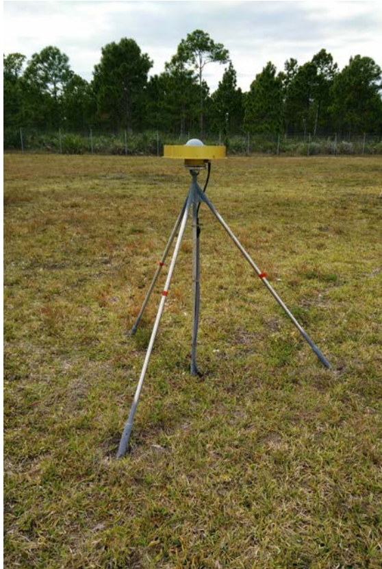
Figures 10 – FLF1 , short drilled braced monument BigAnt.

GPS stations FLF1 and FLF2 are new installations that will provide data to national and international GNSS networks. The instrument reference marks (IRM) and antenna reference points (ARP) were tied to the ground network, which also includes existent marks with historical ties to past SGT instruments here at Richmond. FLF1 is the first of many Foundation CORS Network sites to be installed and operated by NOAA's National Geodetic Survey. The site will also be used as a tracking station for the International GNSS Service. FLF2 is an experimental large format antenna nicknamed BigAnt for its unusual size.