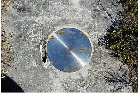
Figure 5 - JPL GPS RICHMOND (RCM4)

RCM4 is a 36-cm (in diameter) stainless steel plate engraved ---JPL GPS RICHMOND 4015-3 1993--- and appears to be anchored to a concrete pad by three metal screw-type fasteners.