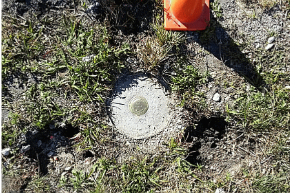
Figure 1 - FLF1 RM 1 (FLR1)

FLR1 is a NGS reference mark disk stamped ---FLF1 NO 1 2014---, set flush with the ground in the top of a 30-cm (in diameter) poured-in-place concrete post extending to a depth of 130 cm.