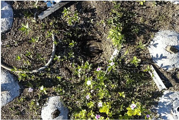
Figure 6 - TIMER (TABV)

RCM4 is a 36-cm (in diameter) stainless steel plate engraved ---JPL GPS RICHMOND 4015-3 1993--- and appears to be anchored to a concrete pad by three metal screw-type fasteners.