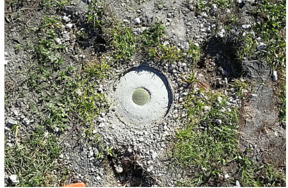
Figure 3 - FLF1 RM 3 (FLR3)

FLR2 is a NGS reference mark disk stamped ---FLF1 NO 2 2014---, set flush with the ground in the top of a 30-cm (in diameter) poured-in-place concrete post extending to a depth of 130 cm.