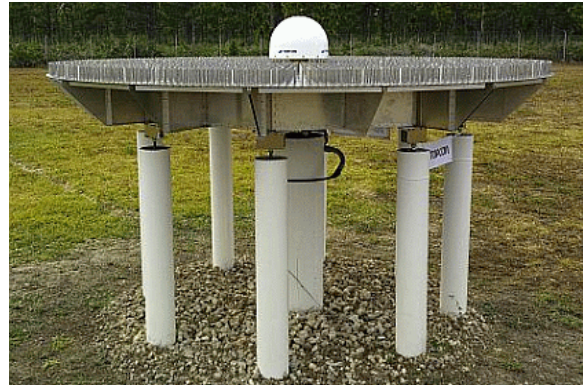
Figure 8 - FL FOUND 2 BIGANT (FLF2)

FLF1 is a dimple within the GNSS antenna adapter of a short drilled braced monument and is centered 0.0083 m beneath the ARP. For more information, enter CORS SiteID FLF1 at NGS's CORS webpage .